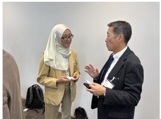
(Scenes of networking reception between MASA and JSMEA members)