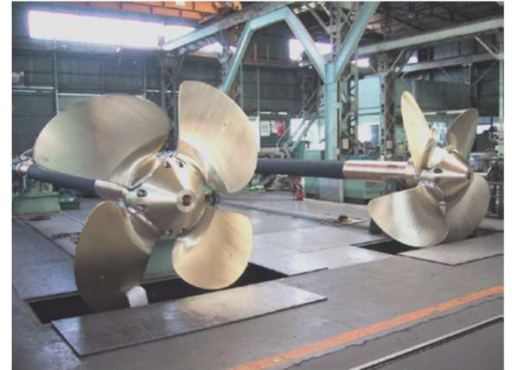
CPC-80A Type CPP for 1,500kW