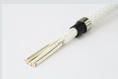
Control equipment cables