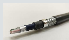
LAN cables Other cables with steel-wire braid sheathing

Feel free to contact us at the following address