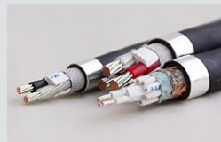
Halogen-free, flame-retardant cables