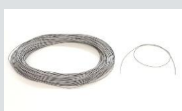
Electric wires for control equipment