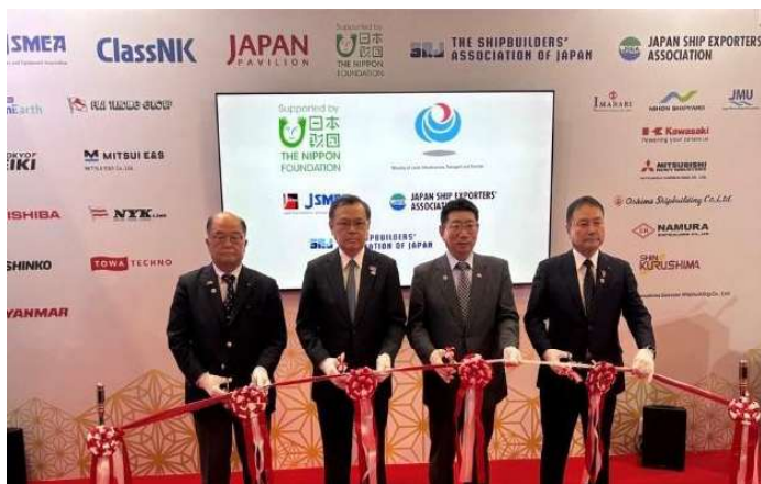
A ribbon cutting ceremony is held at the Japan Pavilion.

The Japan Ship Machinery and Equipment Association (JSMEA) attended Nor-Shipping 2025 in Oslo, Norway on June 3-6, 2025 with financial support from The Nippon Foundation. JSMEA teamed up with Nippon Kaiji Kyokai (ClassNK) in organizing the Japan Pavilion for exhibitions by 10 affiliated and other companies.