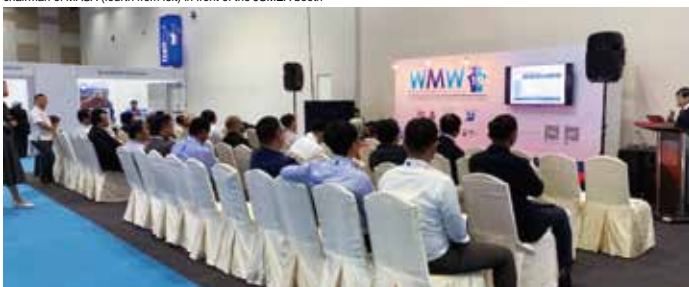
IHI Power Systems gives a presentation.