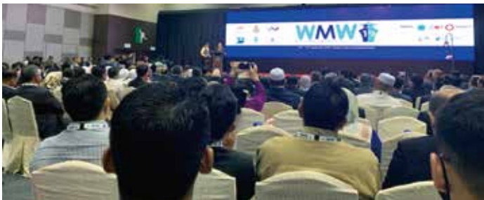
The opening ceremony of the WMW '19