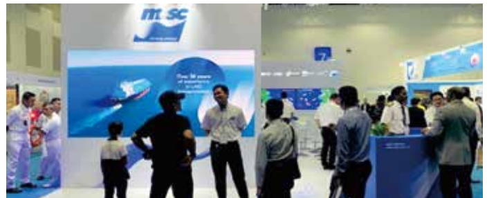
Booths at the WMW '19