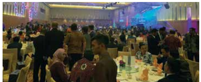
MASA organizes a dinner party.