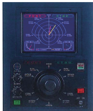
Example of thrust vector