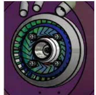
Gas Nozzle with Rotary Cup Burner