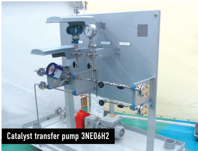
Catalyst transfer pump 3NE06H2